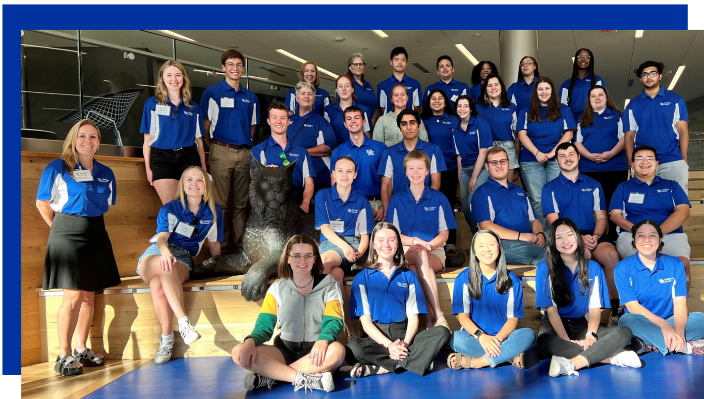
2022 CHELLGREN STUDENT FELLOWS AND STAFF

ALUMNI NEWSLETTER | VOLUME V | 2022-2023